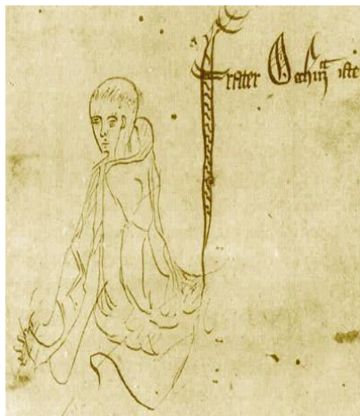
Fig. 2 William of Occam and his knife

Occam's razor must be also used for a close shave: Entia non sunt multiplicanda praeter necessitatem . Or, as frequently noted, the explanation that requires the smallest amount of previous assumptions is most likely to be the true one.