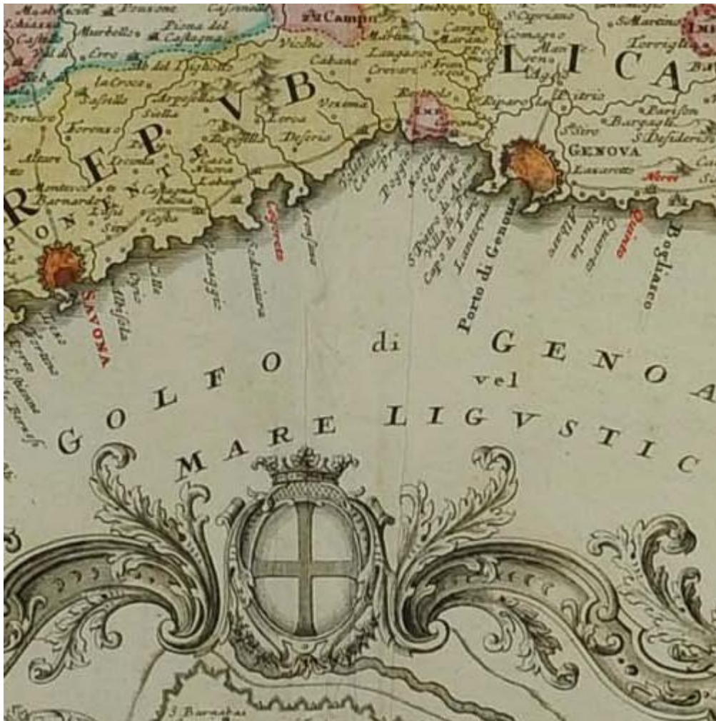
Fig.1 Map of Liguria with the places mentioned by Oviedo marked in red

of them within the province of Liguria or Seignory of Genova.