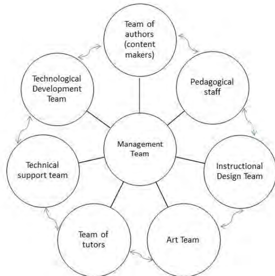
Figure 1. Responsible for construction of digital learning materials

the analysis of any process of distance/online education demands an integrated view on everybody who is in the process of learning, from the learner, the teacher/trainer, instructional materials and technology, the processes of pedagogical and management mediation.